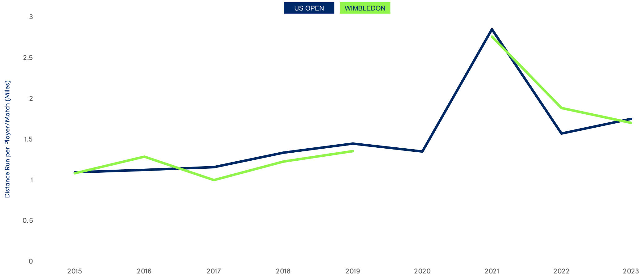
AVERAGE DISTANCE RUN BY A PLAYER PER MATCH (MILES)

The average distance covered by players per match has increased by more than 50% since 2015.